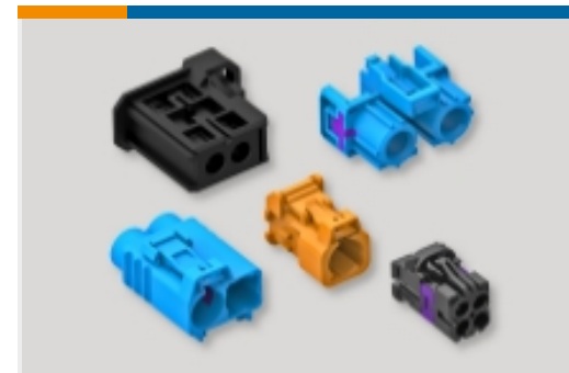
Data Connectivity Housings(3)