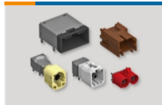
Data Connectivity Headers(2)